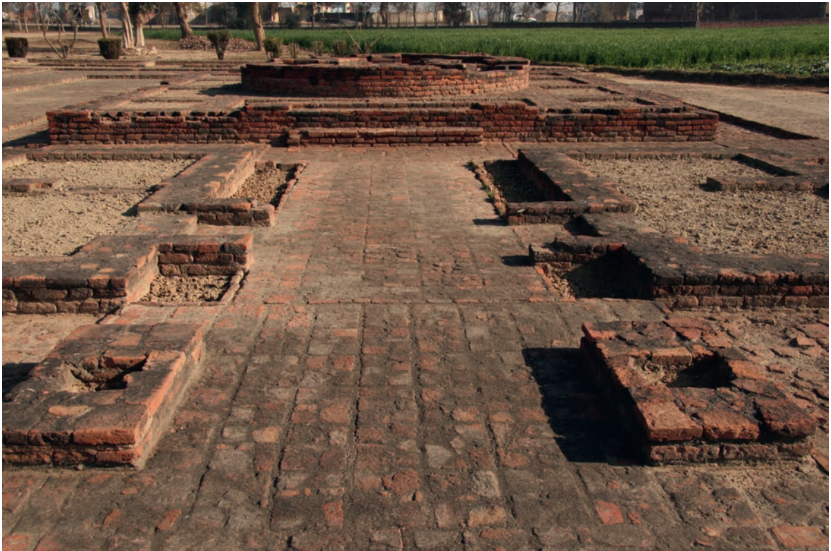
Figure 4: Stūpa complex at SGL-11 at Sanghol.