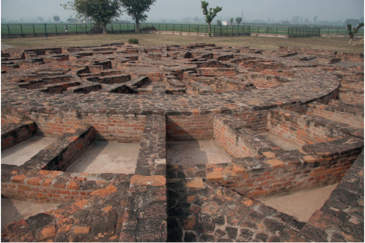
Figure 3. Main wheel-shaped stūpa in SGL-5 at Sanghol.